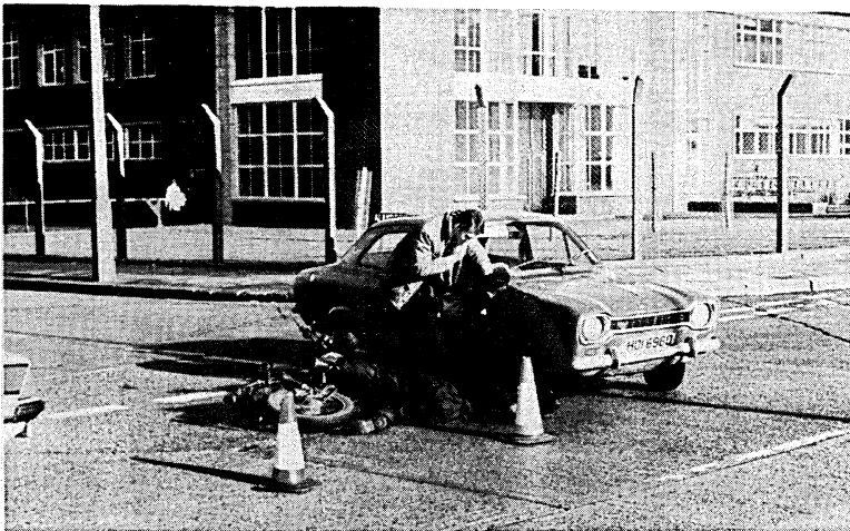
Figure 1 A road accident. One of the many risks of daily life.

Nothing in life is completely safe. We take a risk in everything we do. Even lying in bed, we run a small risk of accidental death — for example, an aeroplane might crash on the house. This risk is very small, and most people accept it without much thought. But some activities — deep sea diving, for example — carry a much higher risk of death. How can we compare risks? Which risks are acceptable, and which are not?