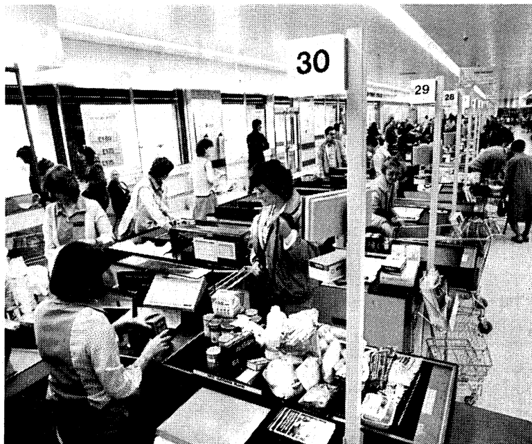
Figure 1 The checkout at a supermarket

Why does food vary so much in price? Why are some foods, like potatoes, cheap, while others, like steak, are expensive? In this unit you will be trying to find out some of the answers. In Part 1 you will carry out a survey of the price of different kinds of food. In Part 2 you will be looking at what decides the price of food.